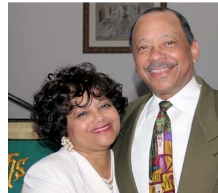
TIMELESS TRUTHS IN ANCIENT GREECE

Scripture Isaiah 55: 6-9 "Seek the Lord while He may be found, call upon Him while He is near. Let the wicked forsake his way, and the unrighteous man his thoughts; Let him return to the Lord, and He will have mercy on him; and to our God, for He will abundantly pardon. 'For My thoughts are not your thoughts, nor are your ways,' say the Lord. 'For as the heavens are higher than the earth, so are My ways higher than yours ways, and My thoughts than your thoughts'"